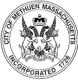
Neil Perry Mayor

The Searles Building, 41 Pleasant Street, Room 206 Methuen, Massachusetts 01844 Telephone (978) 983-8550 Fax (978) 983-8978